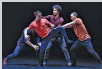
May 2 Dance / circus – Vic's mix Salle Émile-Legault, 7:30 p.m. FP

Until May 12 Exhibition – Participants in the contemporary acrylic paintings and stone sculpture workshops Centre des loisirs, 8:30 a.m. to 9 p.m.