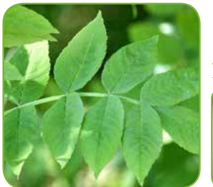
8,5 to 14 mm (length) 3,1 to 3,4 mm (width)

ville.montreal.qc.ca/saint-laurent/emeraldashborer ville.montreal.qc.ca/agrile