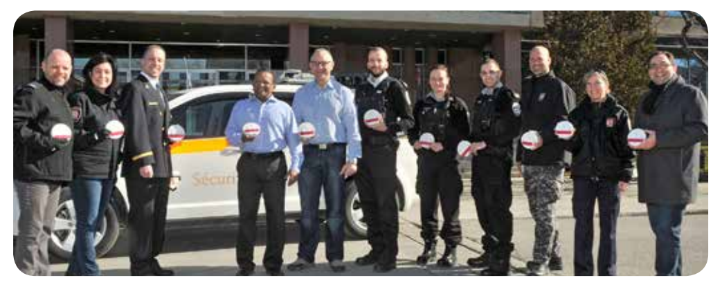
The Mayor of Saint-Laurent, Alan DeSousa , the City Councillor for Norman-McLaren District, Aref Salem , and the City Councillor for Côte-de-Liesse District, Francesco Miele , accompanied by prevention officers from the Service de sécurité incendie de Montréal and members of the Saint-Laurent Urban Security Patrol.

Backed by the Urban Security Patrol, the team visited 280 housing units, 132 of which were inspected. Of these, 56% were non-compliant due the absence or malfunction of the smoke detector. The team distributed a total of 30 batteries and 33 new smoke detectors in order for the residents who were met to be adequately protected.