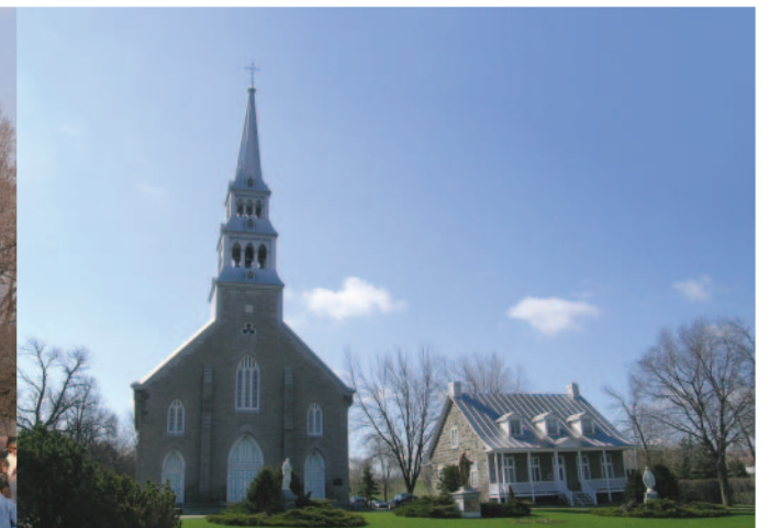
OLD VILLAGE OF RIVIÈRE-DES-PRAIRIES