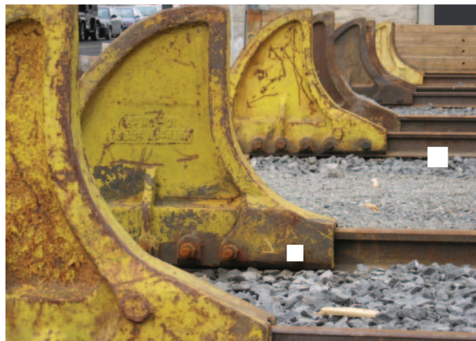
DALHOUSIE SQUARE | OLD MONTRÉAL