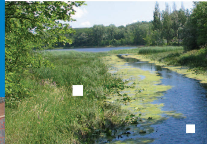
RUISSEAU BERTRAND | PARC-NATURE DU BOIS-DE-LIESSE