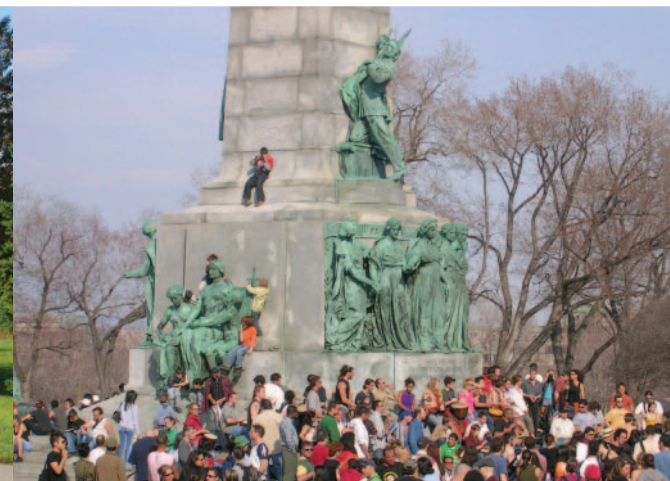
TOM-TOMS AT MOUNT ROYAL PARK