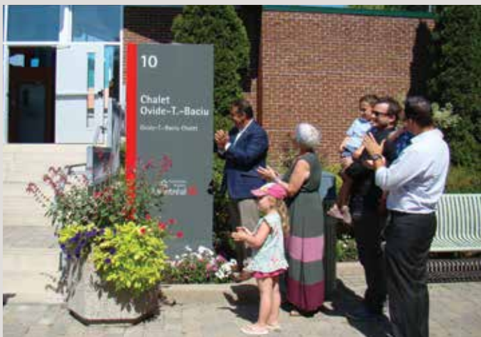
The unveiling of the sign.