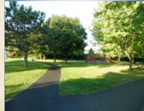
Joseph-Avila Proulx Park