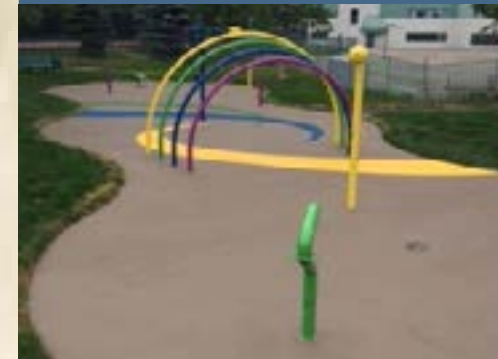
Splash pad at Jonathan-Wilson Park.