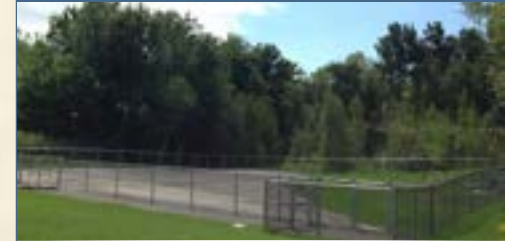
Dog Park on des Bruants Street.

An amount of $300,000 was planned to replace some vehicles in our fleet. This amount was mainly used in 2016, as 2015 was mostly dedicated to preparing tenders.