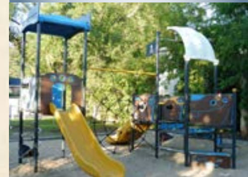
New playground at Saint-Pierre Park.