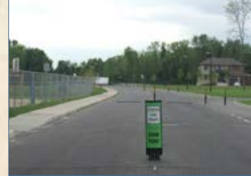
Traffic-calming measures on Chevremont Boulevard.

Acquisition project of a land bordering the Prairies River in Sainte-Geneviève, in order to create a new waterfront park.