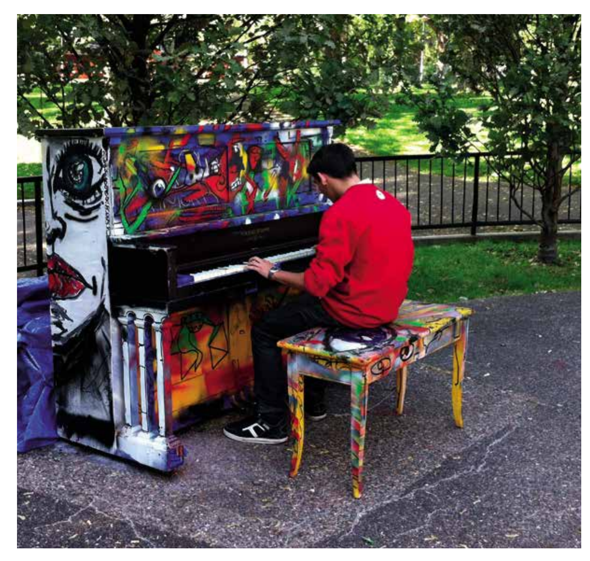
The public piano at parc Notre-Dame-de-Grâce

In August and September, passersby and amateur and seasoned musicians alike took turns tinkling the ivories on two of the borough's busiest sites: parc Notre-Dame-de-Grâce, which is always popular with families, and the corner of chemin de la Côte-des-Neiges and rue Jean-Brillant – a bustling crossroads of culture – each received an outdoor public piano.