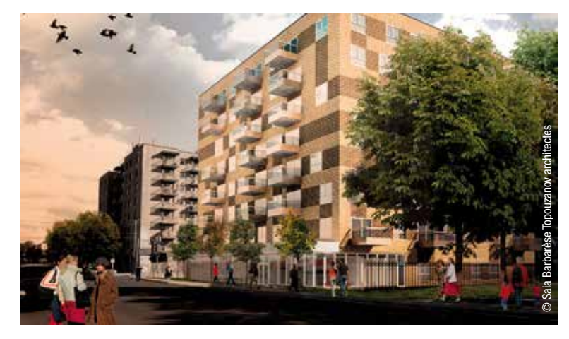
The Borough has invested $2.6 million in the Victoria-Barclay project

Office municipal d'habitation de Montréal and the Ville de Montréal for the residential component, and the borough of CDN-NDG for the communitybased component. The residential portion is being carried out with support from the Société d'habitation du Québec and the Regroupement des organismes du Montréal ethnique pour le logement (ROMEL).