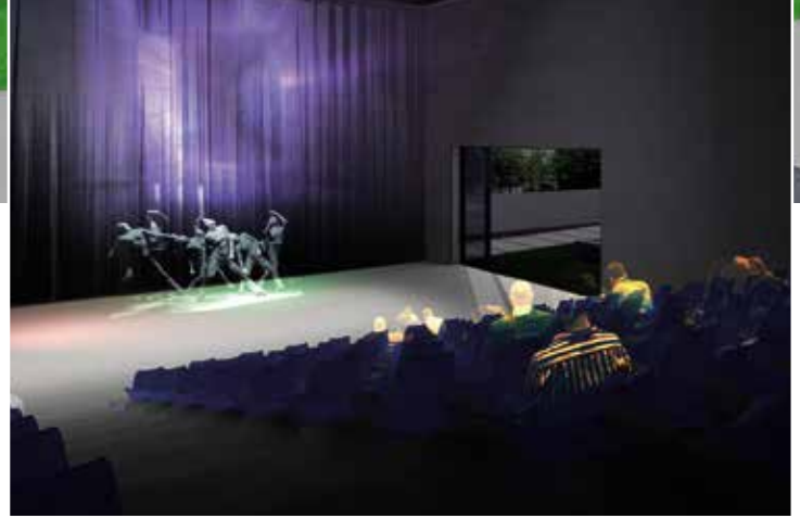
The performance hall, which will boast a seating capacity of 150