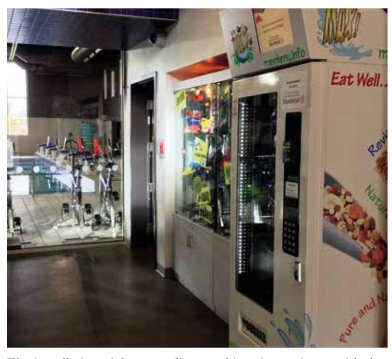
The installation of these vending machines is consistent with the borough's Déclaration pour un arrondissement en santé (Declaration for a healthy borough). Additional machines will be installed in various centres throughout the borough in the coming months.