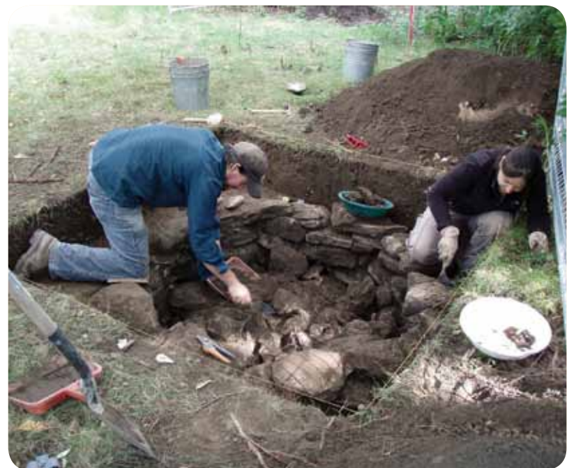
The archaeological digs taking place at Maison Robert-Bélanger have already turned up several items from the original site that have been added to the inventory.