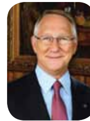
Gérald Tremblay Mayor of Montréal

Alan DeSousa , FCA Mayor of Saint-Laurent