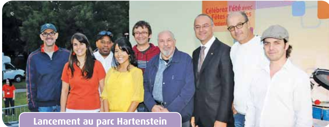
Lancement au parc Hartenstein Launch at Parc Hartenstein

CONT'D FROM PAGE 1 SUMMER CELEBRATIONS UNDER A SHINING SUN