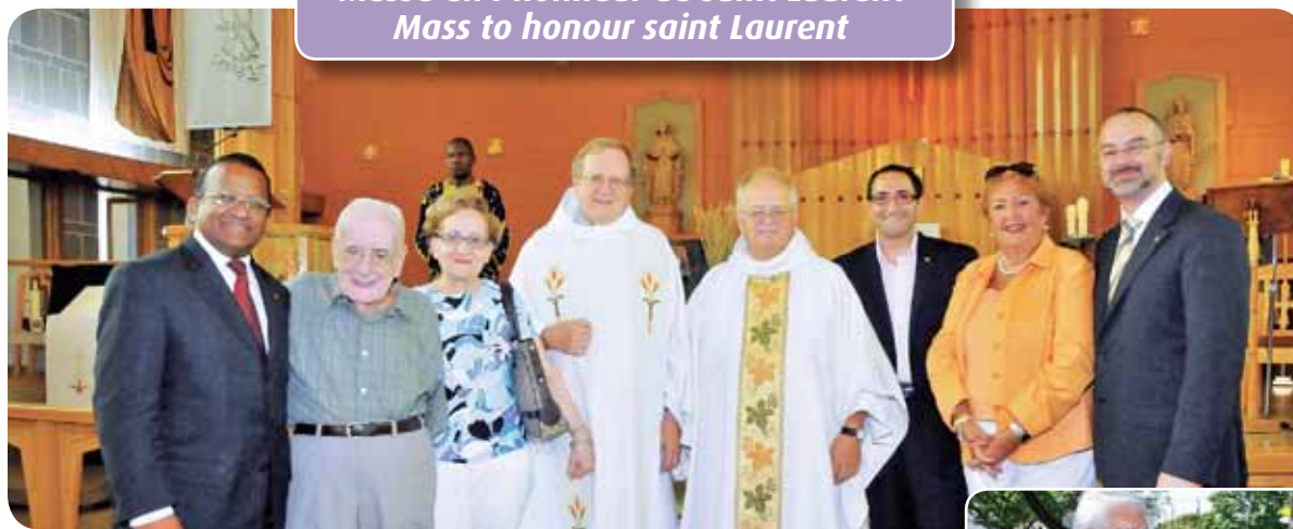
Messe en l'honneur de saint Laurent Mass to honour saint Laurent