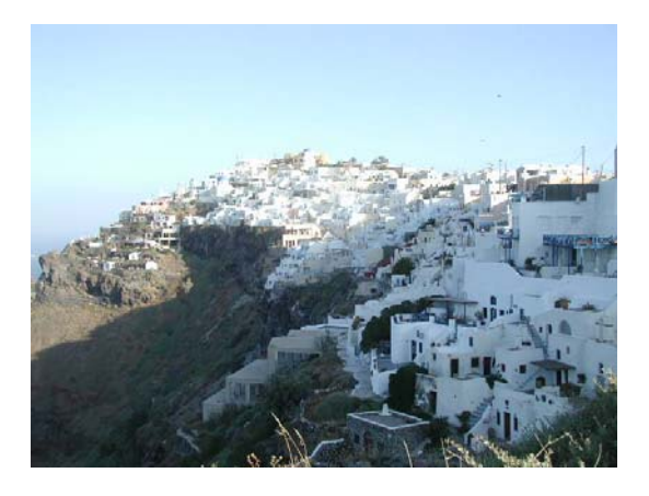
Figure 1. Cool roofs (clockwise, Bermuda, Dallas, and Santorini) offset CO_2 emissions and delay global warming. One hundred square meters (1000 ft<sup>2</sup>) of a white roof, replacing a dark roof, offset the emission of 10 tonnes of CO_2 .

For more information contact: Hashem Akbari, +1-510-486-4287, <u>h_akbari@lbl.gov</u> One Cyclotron Road, Mail Stop 90-2000, Heat Island Group Lawrence Berkeley National Laboratory, Berkeley, CA 94720, USA