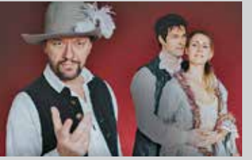
October 30 Theatre – Cyrano de Bergerac (in French) Salle Émile-Legault, 7:30 p.m.

October 21 Métamorphoses et transformations (in French) Bibliothèque du Boisé. See page 6.