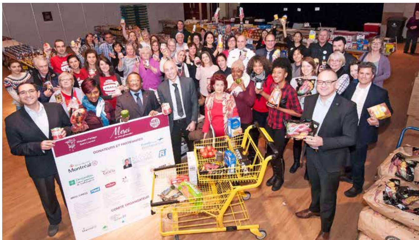
Gathered at the Centre des loisirs de Saint-Laurent for the Magasin-partage de Noël 2017, representatives of donor agencies and volunteers are seen surrounding the City Councillor for Côte-de-Liesse District, Francesco Miele , the Mayor of Saint-Laurent, Alan DeSousa , the Borough Councillor for Côte-de-Liesse District, Jacques Cohen , and the City Councillor for Norman-McLaren District, Aref Salem .

Saint-Laurent would like to extend its warmest thanks to the organizing committee, donors, volunteers, and municipal employees who made the Magasin-partage de Noël 2017 possible.