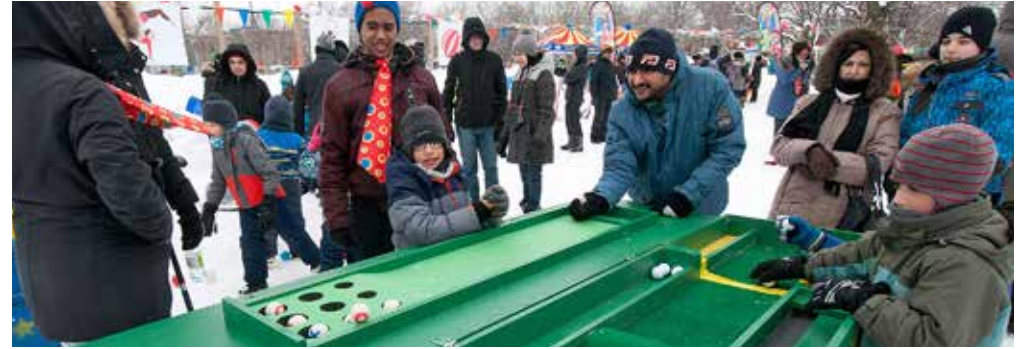
The Mayor of Saint-Laurent, Alan DeSousa , surrounded by Saint-Laurent families at the 25 th edition of the Fête d'hiver.