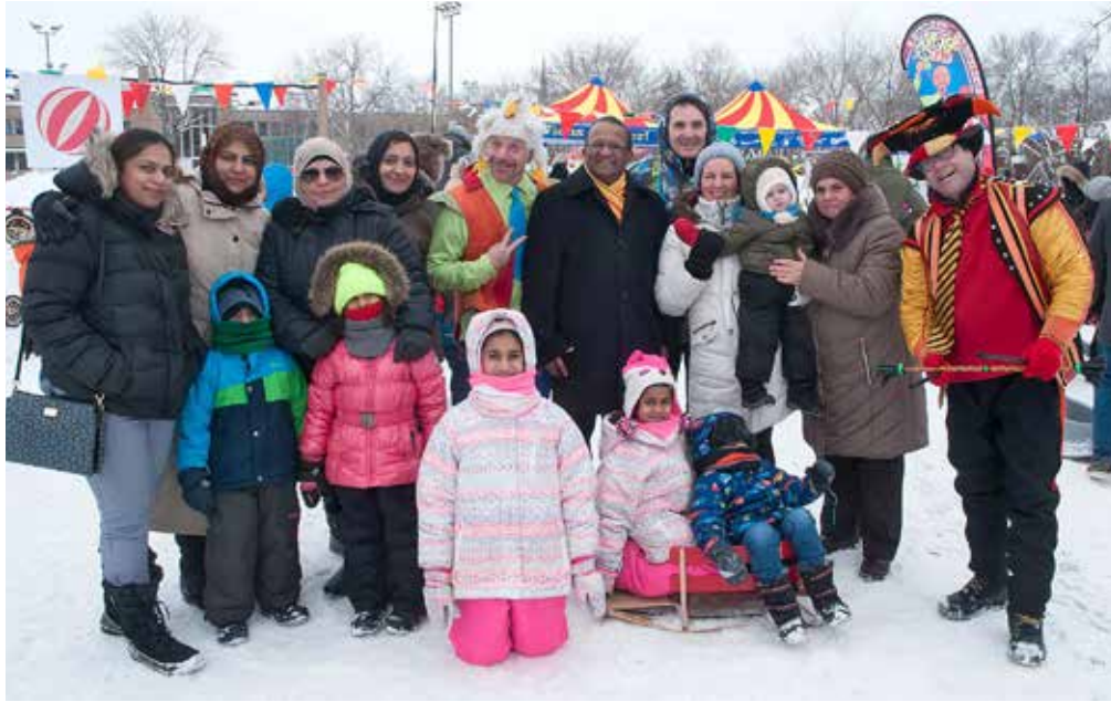
Le maire de Saint-Laurent, Alan DeSousa , entouré de familles laurentiennes lors de la 25 e édition de la Fête d'hiver.