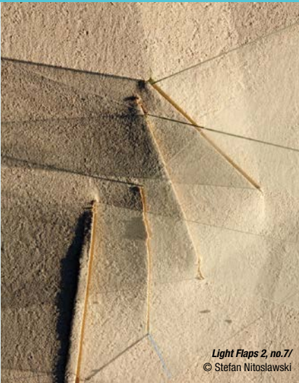
Light Flaps 2, no.7/ © Stefan Nitoslowski

February 1 to March 11, 2018 Free admission