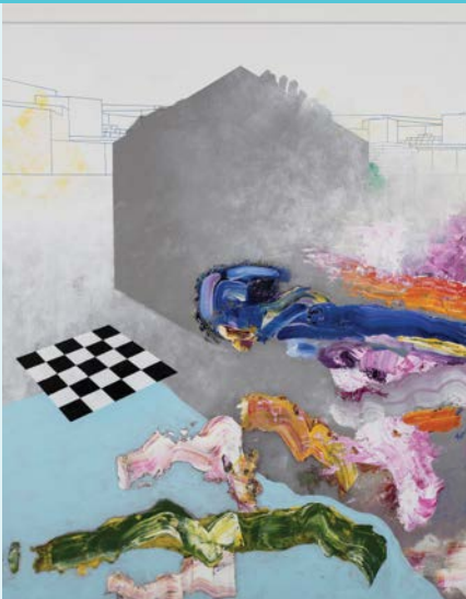
Dérèglement 22, acrylic on wood, 36 x 36, 2016 © Ivan Binet

February 1 to March 11, 2018 Free admission