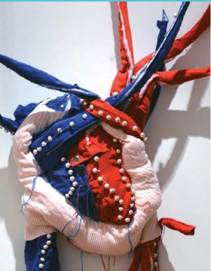
Rouge et bleu jeans (detail) 2015, clothing, flock and buttons 130 cm X 170 cm X 25 cm © José Luis Torres