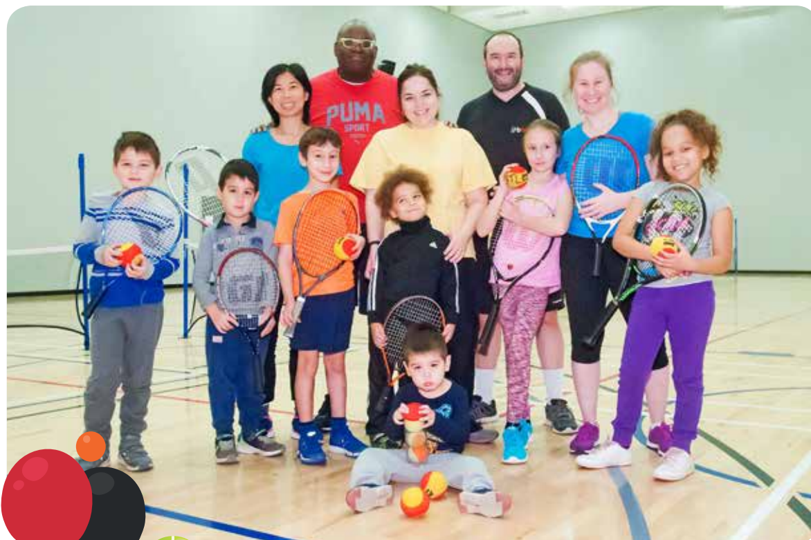
Some participants playing mini tennis, a new activity offered at the Sports Complex.