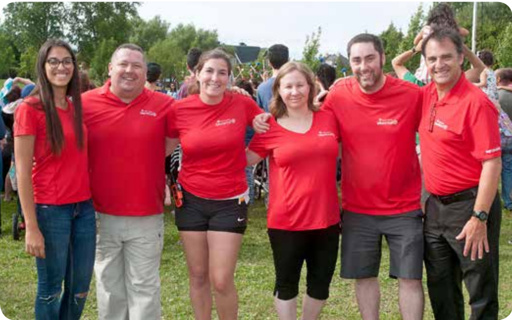
Une partie de l'équipe de Saint-Laurent derrière le succès de la Fête sportive. Part of the Saint-Laurent team behind the success of the Fête de la rentrée sportive.