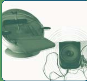
Agence Topo. Civilités— Post-Audio NetLab.