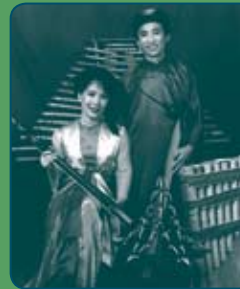
L'Ensemble Khac Chi.