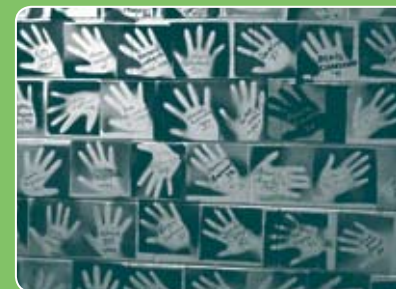
Une école sans frontières.