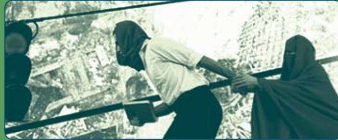
Agence Topo. Civilités.