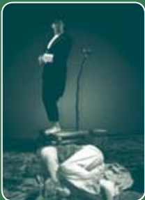
Le Chien et la Pie. Le Théâtre Maât.