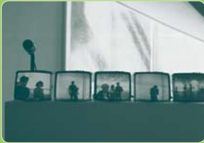
Art & D dans l'île. Memory/Recollection.