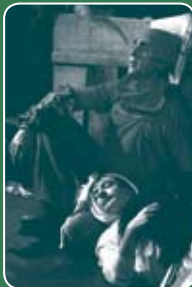
Une lune entre deux maisons. Théâtre Les Lucioles.

► Sun. Apr. 30, 2 p.m. Théâtre Outremont (OU). ⑤