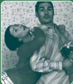
Julio et Romette ou Hibiscus.