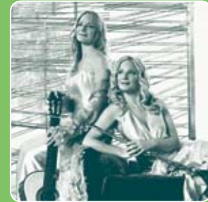
Fantasia pour flûte et guitare. Duo Similia.