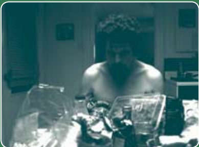
Le Golem de Montréal.