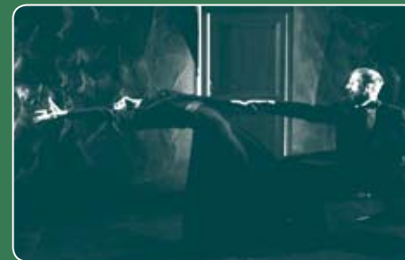
Satie, agacerie en tête de bois. Les Nuages en pantalon.