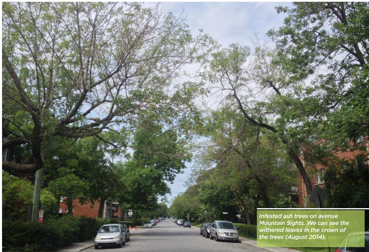
Infested ash trees on avenue Mountain Sights. We can see the withered leaves in the crown of the trees (August 2014).