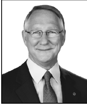
Gérald Tremblay Mayor