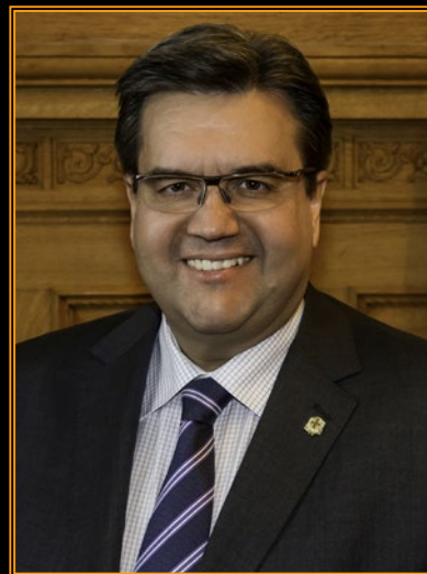
Denis Coderre Mayor of Montréal