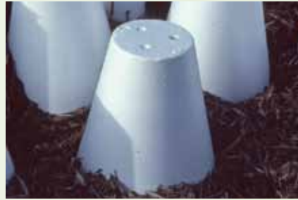
Protection cone - Jardin botanique de Montréal (Jean-Pierre Bellemare)

from digging tunnels between soil and snow and it destroys existing ones. This method can also be used to avoid damages to grass.