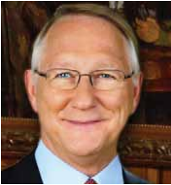
Gérald Tremblay Montréal Mayor