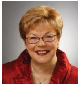
Monique Worth Borough Mayor