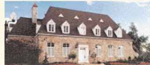
Centre culturel de Pierrefonds

locationspierrefonds-roxboro@ville.montréal.qc.ca