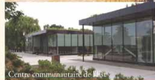
Centre communautaire de l'Est