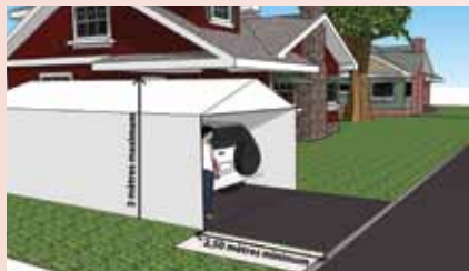
Illustration: Éric Massie

Please note that the non compliance with legislation on temporary shelters is considered an offence for each requirement that is not respected and is liable to a fine.