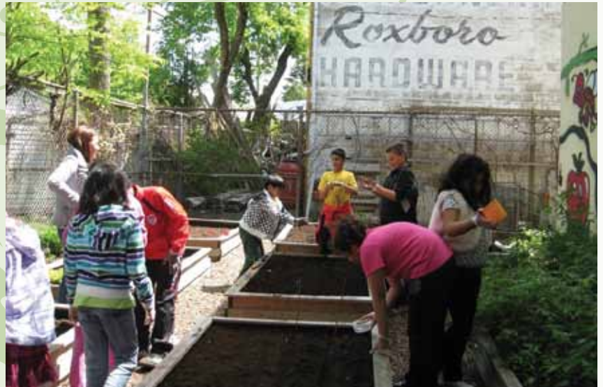
Lalande School students while gardening

The éco-quartier has also been working with Lalande School in Roxboro, gardening with 3 classes and their teachers in the vegetable garden located behind the éco-quartier's office. An animator was hired to accompany, teach, inform and support these new participants in all the necessary steps to planting a successful garden. During the summer vacations, the green and blue patrollers, our volunteers, and employees from the éco-quartier will maintain the garden until school starts up again at the end of the summer vacations. When students return they will then be able to profit from the harvest of these plants.