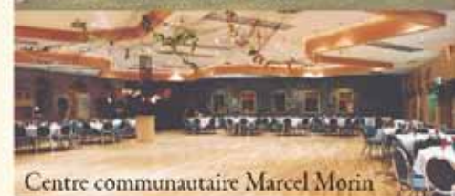
Centre communautaire Marcel Morin