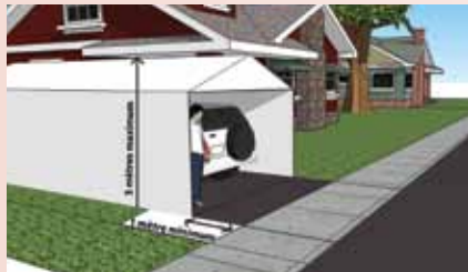
Illustration: Éric Massie