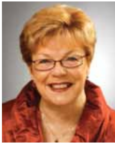
Monique Worth Borough Mayor