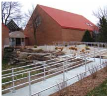
Borough Hall's West entrance is now accessible for persons with reduced mobility.