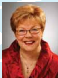
Monique Worth Mayor