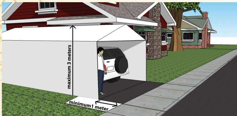
Illustration: Éric Massie

Please note that the non compliance with legislation on temporary shelters is considered an offence liable to a fine for each not respected requirement.