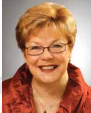
Monique Worth Borough Mayor