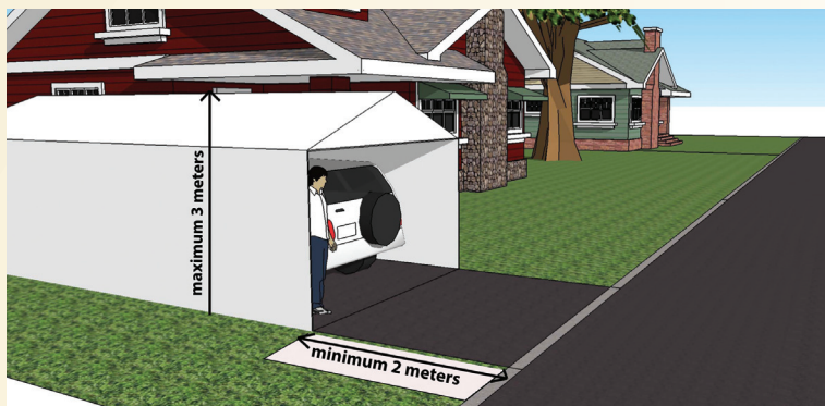
Minimum distance between the shelter and the sidewalk