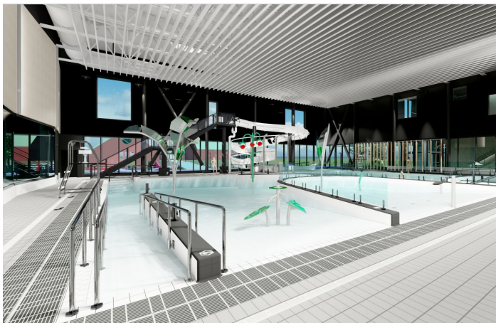
The recreational pool