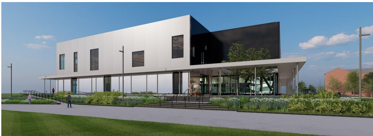
The exterior of the complex

Photo credits : Héroïse Thibodeau Architect | Atelier Paul Laurendeau | Architect