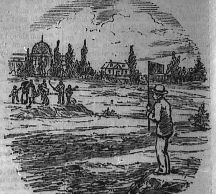
The Fore Caaie.