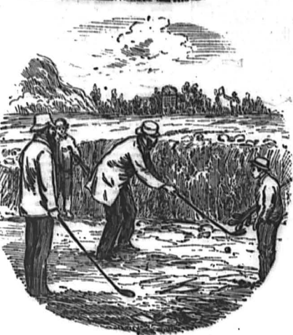
Driving the Quarry hole.