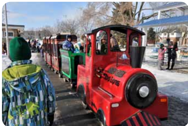
Le Royal Express ne s'est pas désempilé de l'après-midi. The Royal Express ran all day long.