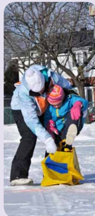
Dans le sac pour la course à relais! The relay race is in the bag!