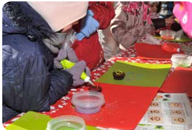
Pas moins de 1000 petits gâteaux se sont envolés pendant l'atelier. No fewer than 1000 cupcakes were devoured during the workshop.