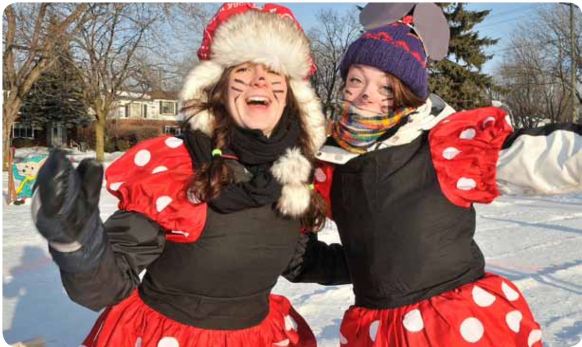
Deux souris Minnie bien habillées pour braver le froid. / Two Minnie mice dressed for the cold!