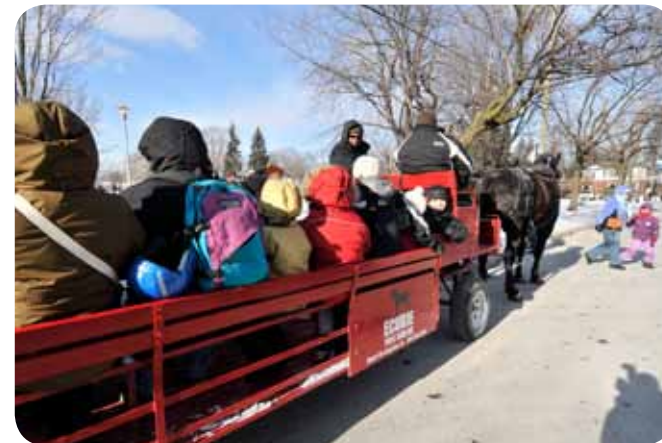
Les tours en cariole sont toujours l'une des activités préférées à la Féerie. The horse-drawn carriage rides are always a favourite during the Féerie.