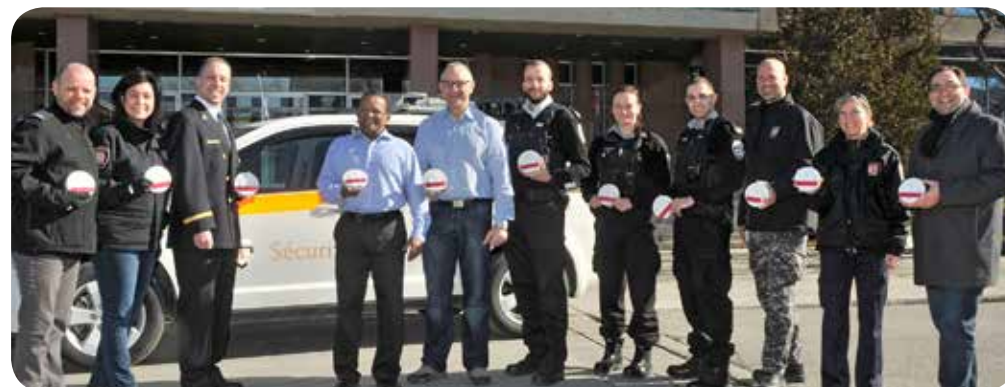
The Mayor of Saint-Laurent, Alan DeSousa , the City Councillor for Norman-McLaren District, Aref Salem , and the City Councillor for Côte-de-Liesse District, Francesco Miele , accompanied by prevention officers from the Service de sécurité incendie de Montréal and members of the Saint-Laurent Urban Security Patrol.

Backed by the Urban Security Patrol, the team visited 280 housing units, 132 of which were inspected. Of these, 56% were non-compliant due to the absence or malfunction of the smoke detector. The team distributed a total of 30 batteries and 33 new smoke detectors in order for the residents who were met to be adequately protected.