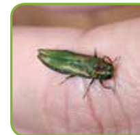
An example of damage caused by ash borer.

8,5 to 14 mm (length) 3,1 to 3,4 mm (width)