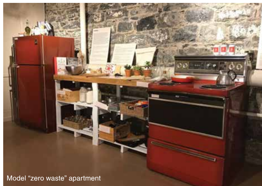
Model “zero waste” apartment

Free event. Door prizes. A family-friendly activity!