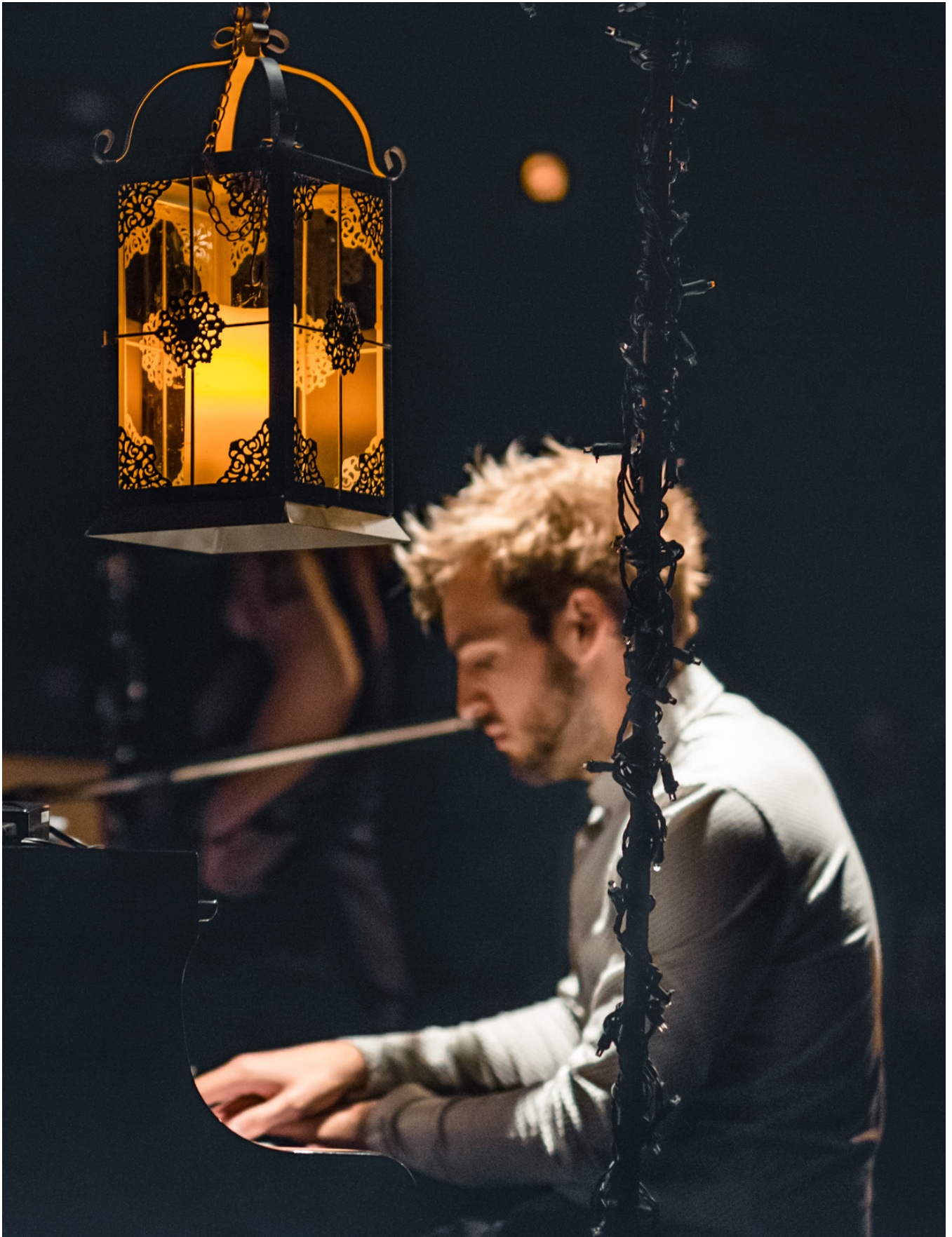
Borough of LaSalle 2019