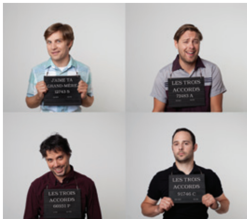
LES TROIS ACCORDS

More details starting in June at www.lachine.ca