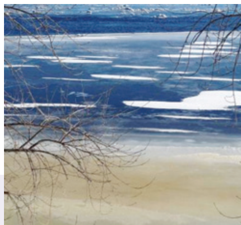
Lac Saint-Louis 2015.