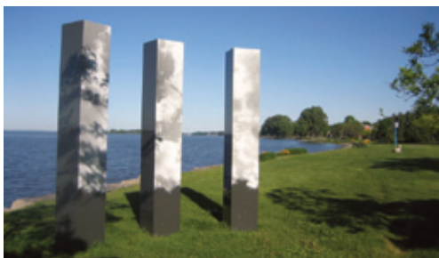
Linda Covit, Theatre for Sky Blocks, 1992

A magnificent example of 17th century French architecture, Ber-Le Moyne House is a designated historical site. Inside, you'll find over 400 historical and archeological artefacts illustrating the life of its occupants throughout the centuries.